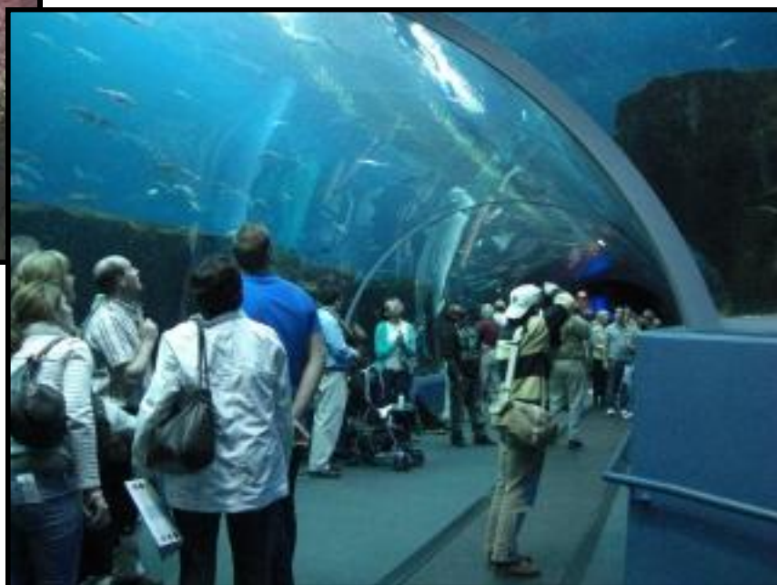
Georgia Aquarium — MTNA National Convention